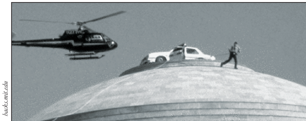
The infamous MIT "fake CP car on the Great Dome" – complete with working lights and disassembly instructions, seat belt when traveling at "Ludicrous Speed."

There you are, folks; now you know how to make a practical joke fun for everyone. If you want to learn more about ethical pranking or just want to perfect your technique, check out Sir Hargrave's book at mischiefmakersmanual.com and help keep those hard working folks on their toes.