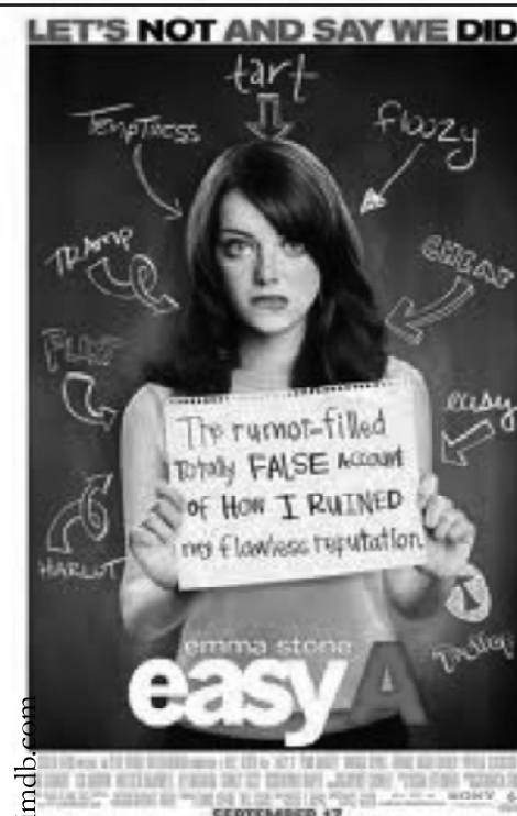
Emma Stone stars in "Easy A."