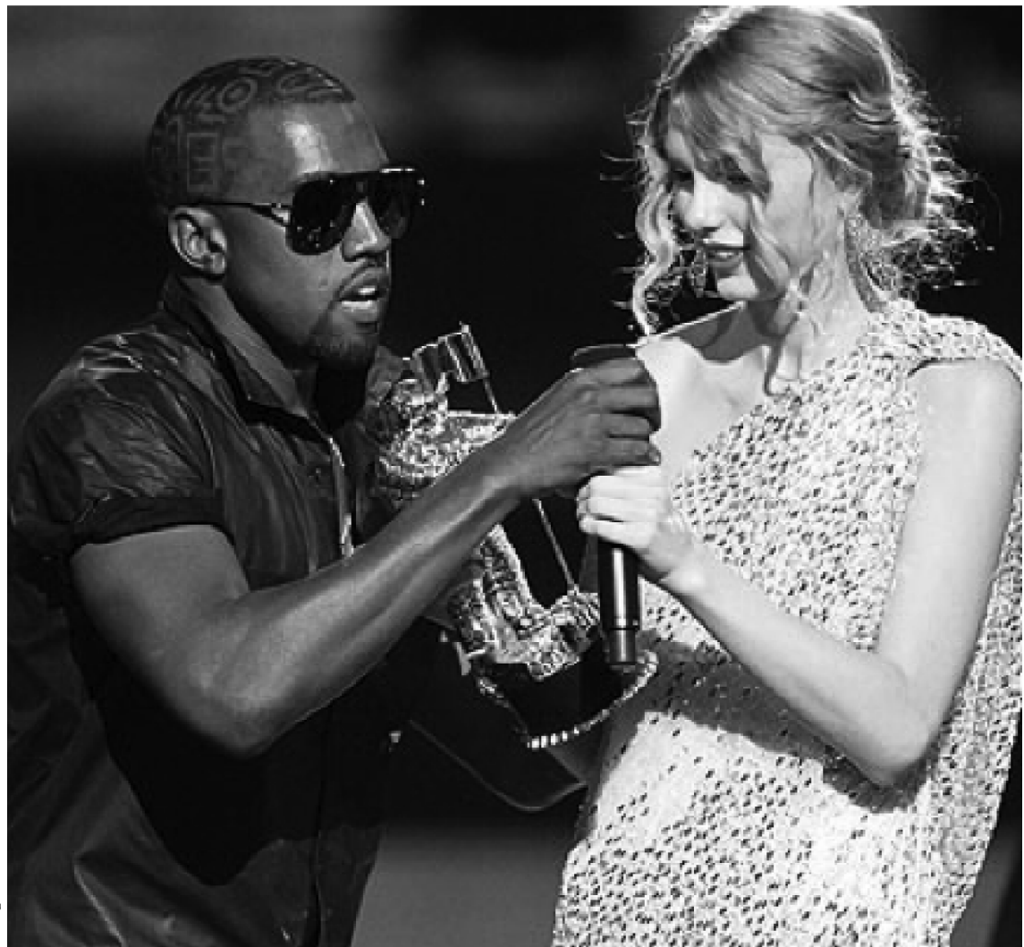
Kanye West stealing Taylor Swift’s moment at the 2009 VMA’s