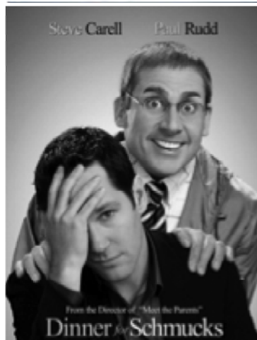
"Dinner for Schmucks"

If you were looking for a more “grown up” movie, “Grown Ups,” starring Adam Sandler, Kevin James, Chris Rock, David Spade and Rob Schneider, would be a great choice. A comedy with some life lessons laced in, you wouldn’t walk away disappointed. The guys were all best friends back in their hay days of high school, but when life got in the way, they all lost touch. When a favorite basketball coach of theirs passes away, they reunite and realize how much they meant, and still mean, to each other. They spend the weekend with each other and their families; they get to