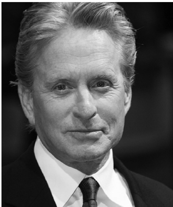
Award Winning Actor Michael Douglas

Have an opinion? Write a letter to the Editor! We are always looking for more opinion submissions.