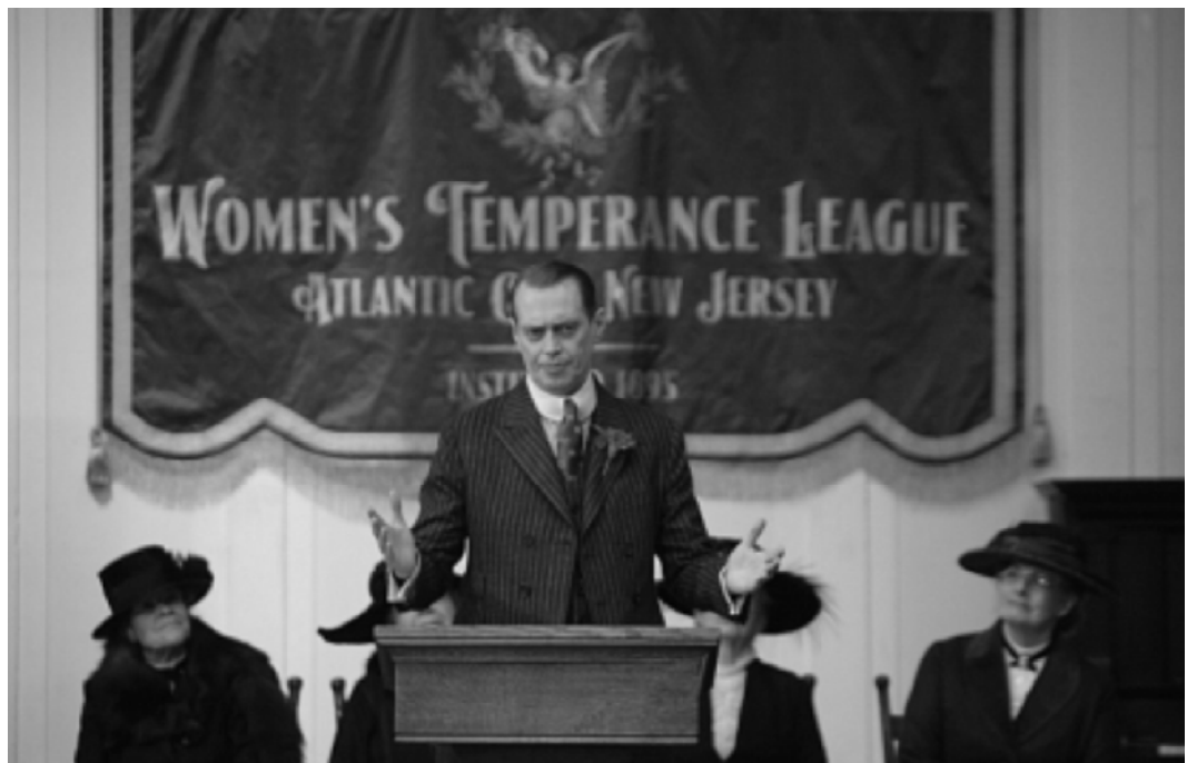
Nucky Thompson (Steve Buscemi) beguiles the Women’s Temperance League into giving him their support.

Anyway, the first episode was generally finely wrought and seemingly representative of the times (though liberties must necessarily have been taken). HBO seems to have yet another stellar series on its hands, and viewers are sure to continue tuning in.