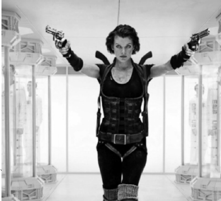
Alice (actress Milla Jovovich)

States following the previous three movies of the franchise. Once Alice makes her way to Alaska, she is greeted by an airfield and an empty beach. There is no one around, until Alice spots a woman. After a small attack, Alice finds the women to be a well-known friend of