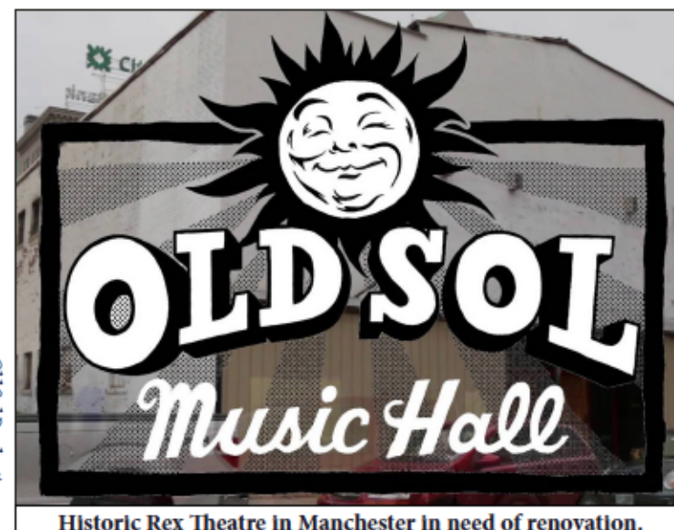
Historic Rex Theatre in Manchester in need of renovation.

Old Sol Productions, Limited-Liability Company (LLC), a new company looking to build a music venue, is working on a pro-