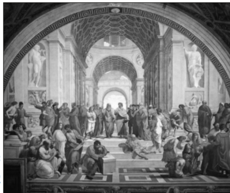
Raphael, "The School of Athens."

This past weekend allowed all of my daydream FAS 201 fantasies to come true. I stood in the presence of works of art that, only a semester ago, were simply pictures in a textbook or on a quiz. I think I walked around for over two hours with my jaw open and my neck craned all the way to the ceiling in the hopes that I could take in even a small portion of the things I saw. The tour through the Vatican Museum is an age old example that it is