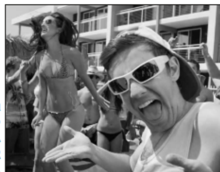
The Lonely Island