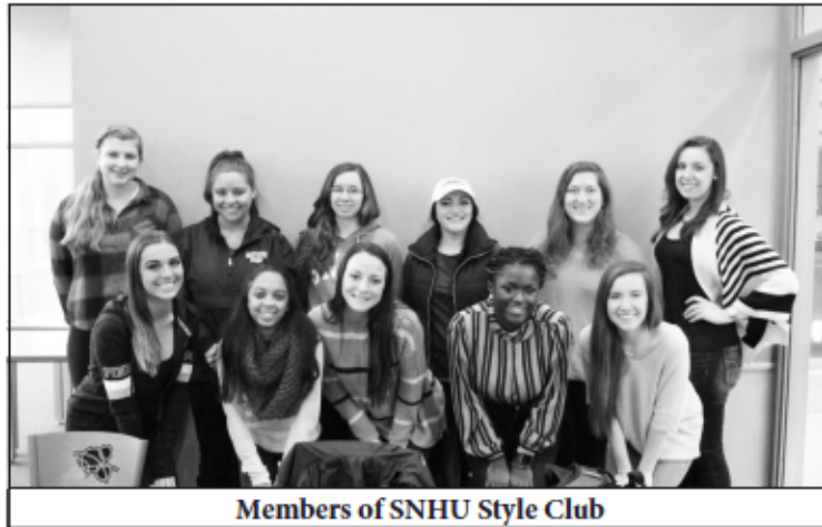
Members of SNHU Style Club

The show will feature fashions from local retailers in the Manchester area and "East Coast Casual" – a graphics t-shirt com-