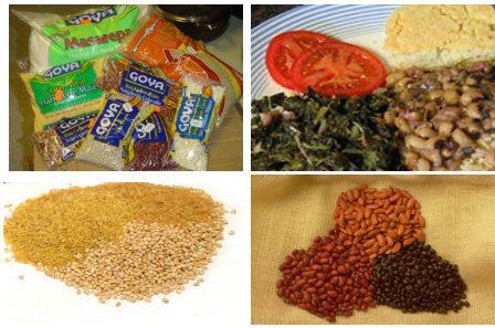
Vitamiini za B, Feri, “Folate”, “Fiber” na Poroteyini

Bikenewe mu kubaka imitsi, mu gukora neza k’umutima, kujyana “oxygen” mu mubiri, kurwanya indwara n’ibindi bibazo umwana ashobora kuvukana. ‘Fiber’ ifasha kutagugara mu nda, kugabanya “cholesterol” ikanapima “glucose” ikenewe mu maraso. Poroteyini ni ingenzi cyane mu kubaka imitsi, “hormones, enzyme” n’ibirinda umubiri. Soya irimo poroteyini nyinshi. Kuvanga ibishyimbo n’umuceri, ibigori cyangwa ibindi binyampeke bitanga poroteyini nyinshi. Ibiryo bigaragara kuri iyi foto—ibishyimbo, umuceri, n’ifu y’ ibigori—bitanga indyo ikize kuri poroteyini n’ ubwo nta nyama zirimo. Imboga rwatsi zongera feru, na vitamini. Itomati zo zongera vitamini C. Indyo y’invange ni ingenzi ku mubiri.