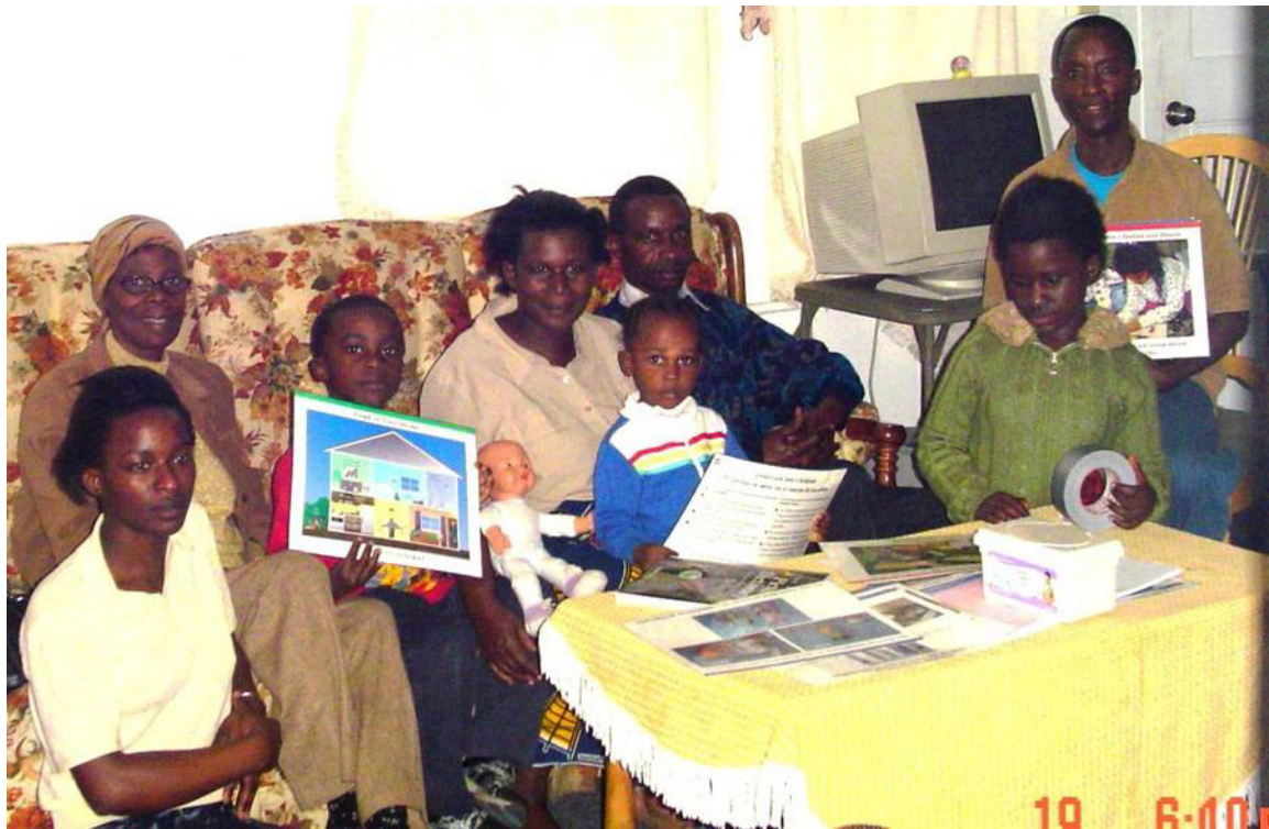
The project director with The Way Home staff during a home visit