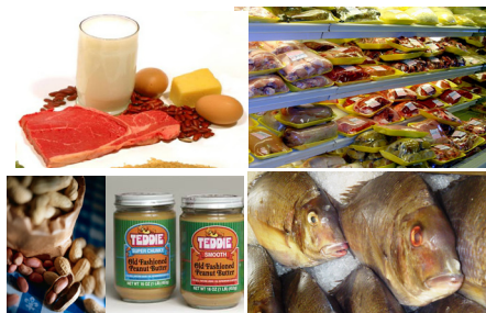
Poroteyini na Feri

Kurya ibiryo byiza no gukora imyitozo bifasha kubaka imibiri. Reka turebe bimwe mu biryo by'ingenzi. Kora uko ushoboye uvuge uko wumva umeze n' ibyo wakora mu gihe ufite ubuzima bwiza; unavuge ku byerekeye ibiryo bidafite intungamubiri kandi bikaba bituma umuntu agira ubuzima bubi.