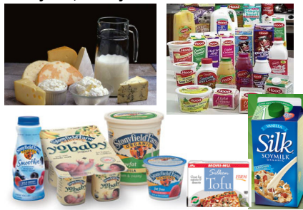
Karisiyumu, Poroteyini na vitamini D

Ibikomoka ku mata na soya biduha kalisiyumu, vitamini D na poroteyine nyinshi imibiri yacu ikeneye kugira ngo ikomeze amagufa, amenyi n’ imitsi. “Yogurt” yongera itungamubiri zo gufasha kutagugara mu nda. Akenshi, n’ abantu bafite ibibazo byo kugugara mu nda kubera ko banyweye amata cyangwa bariye foromaje bashobora kurya “yogurt” yuzuyemo karisiyumu, vitamini D na proteyine nyinshi. Shakisha “yogurt” irimo “lactobacillus acidophilus” nka “Stonyfield Farm yogurt.” Amata ya soya na tofu bishobora gusimbura amata n’ibindi biyakomokaho; bikaba binafite karisiyumu, vitamini D na poroteyini nyinshi.