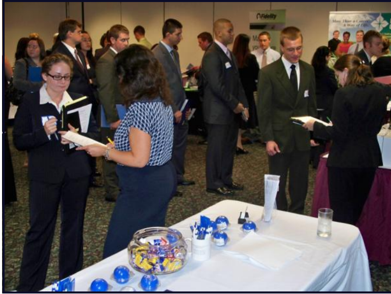
Accounting & Finance Career Night 2010