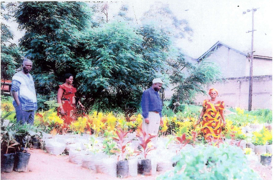
Temporary tree nursery at Nyakato - November, 2006