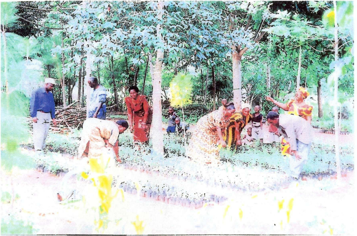
Tree nursery at Buswelu