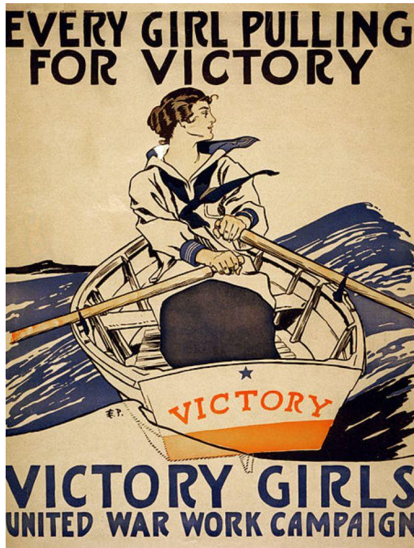
Figure 2: "Victory Girls" propaganda poster (1917)