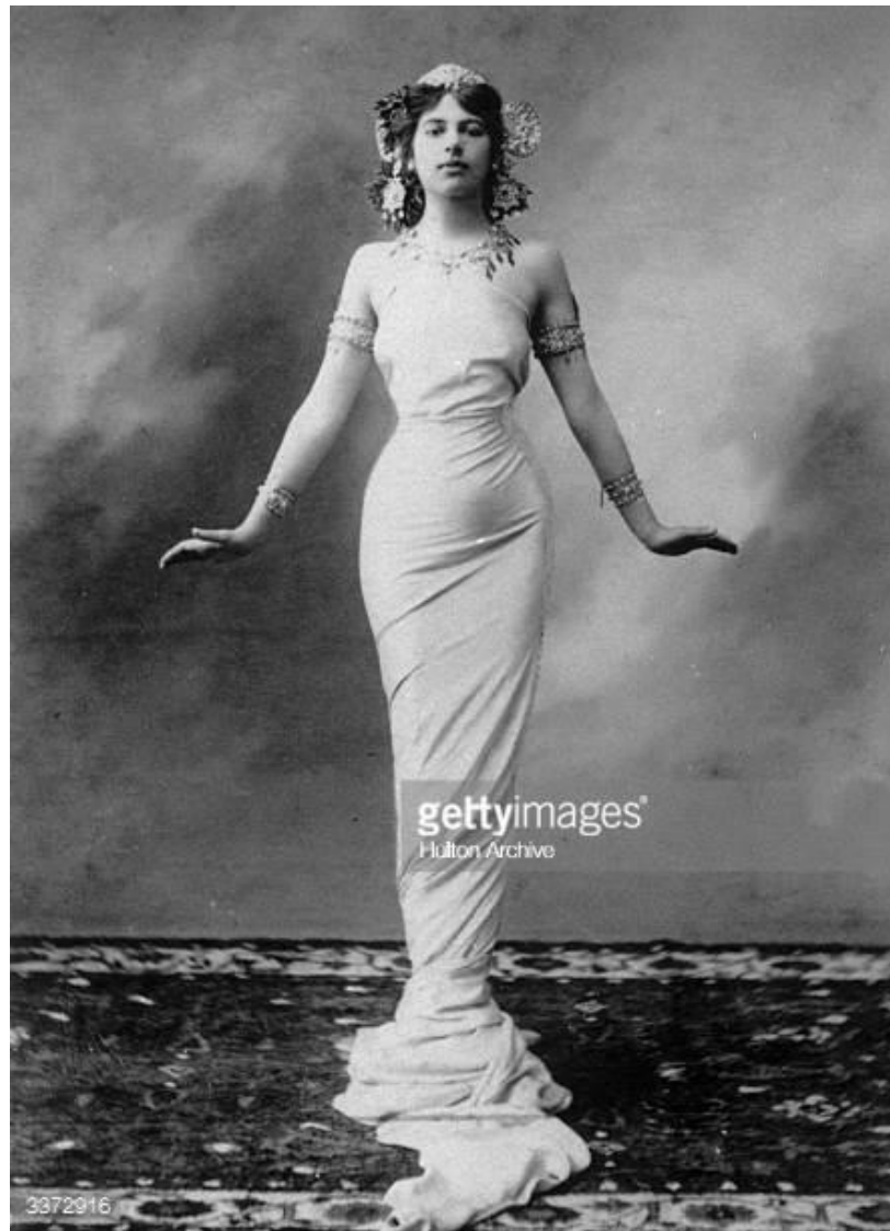
Figure 3: Margaretha Geertruida Zelle, a.k.a. Mata Hari.

Image copyright Hulton archive. File #3372916. Getty images. 2018.