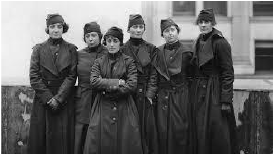
Figure 1: American Servicewomen in Paris (1918)