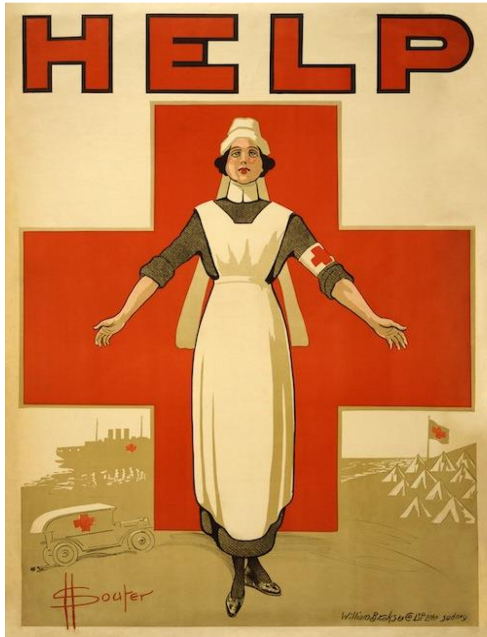
Figure 8: Red Cross Nurse Propaganda Poster by William Souter (1917)

Source: William Souter, "Help," 1917. Image source: Google Website, accessed June 4, 2018,