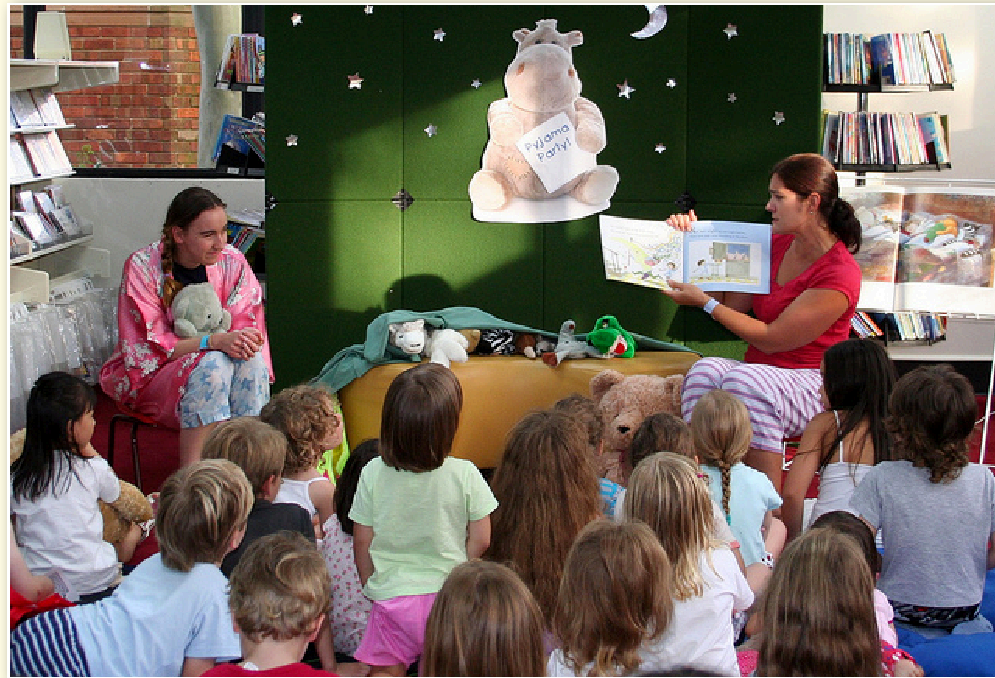
Figure 2. Adapted from “Bilingual Books: Read Them Out Loud,” by LanguageLizard. (2011, August 5) Bilingual Books: Read Them Out Loud. Message posted to http://blog.language lizard.com/2011/08/05/bilingual-books-read-them-out-loud/