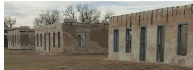
Officers' Quarters Ruins January 2018

In order to preserve these ruins and foundations for the future