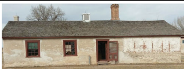
Old Bakery January 2018

The Bakery, along with the Post Hospital, was one of the most important buildings to the general welfare of the enlisted soldiers at Fort Laramie. The Old Bakery, built in 1876, and the New Bakery Ruins, built in 1883, were used to bake the bread that was a primary element of the soldier's meal rations.