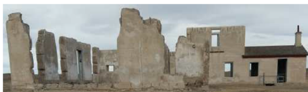
Hospital Ruins January 2018

Throughout Fort Laramie, there are many standing ruins and visible foundations. In fact, what is seen now is only about one-third of what existed at Fort Laramie during its peak years. When Fort Laramie was abandoned in 1890, the buildings were put up for public auction. Many of these buildings that you can see now were purchased to be used as homesteads, businesses, and housing for livestock. Although these buildings received harsh treatment, because they were