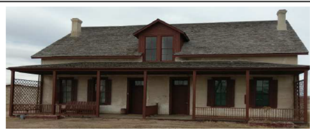
Post Surgeon's Quarters January 2018

keystone of the Army medical care system. The Post Surgeon was charged with keeping up the health of all officers, their families, enlisted men and civilian employees of the U.S. Government who lived or came to the Fort. The Post Surgeon would also keep records of weather as well as collected and preserved scientific specimens, which provided crucial information to institutions further east. 6 The Post Surgeon was usually the most highly educated at an Army post and were