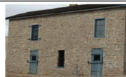
Prisoner Lockup Area of Old Guardhouse January 2018

The lower level of the guardhouse was designed to hold forty prisoners without any furniture, stove for heating or