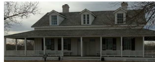
Captain's Quarters January 2018

One aspect of living at Fort Laramie is that many Officers brought their families with them to live. The wives of