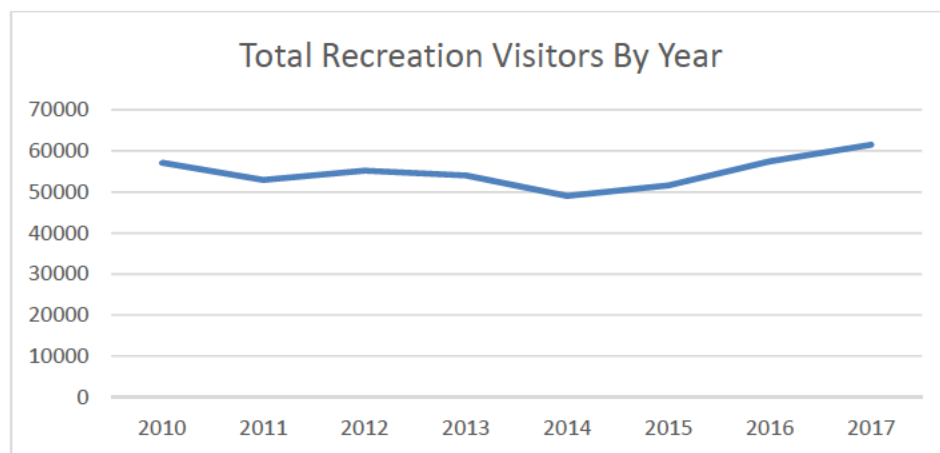
Figure 1: Recreation Visits by Year

Park Ranger Fullmer approximated the average visitor in the last few years: eighteen percent visit by tour bus, a significant number of visitors are mostly older and are most identify white/Caucasian. 4 Along with this average group, there are a significant number of school groups that visit the site from around the state of Wyoming as well as surrounding states like Colorado and Nebraska. Figure 2 shows Recreational Visitor statistics from the National Park Service Visitor Use Statistic website.