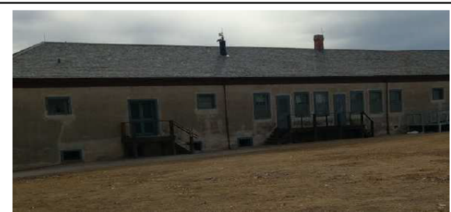
Commissary Store House/ Visitor Center January 2018

Goods were stored with preservation methods including salting, smoking, canning, pickling, and drying. Food items such as meat, potatoes, onions, bacon, and hardtack all needed to be inspected regularly. If the need arose, the commissary sergeant