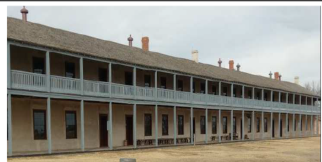
Cavalry Barracks January 2018

Currently, the barracks are divided, the south end of the barracks have been restored to the period of the Indian Wars of the 1870s and 1880s. Visitors can explore various rooms including the kitchen, squad bay, and messroom. The Park Service Rangers also used the barracks as part of the Ranger talks and for many events