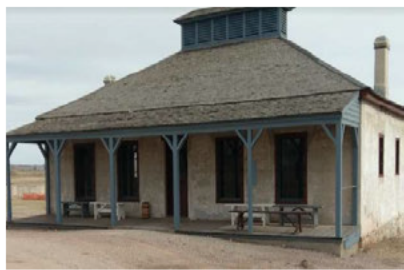
New Guardhouse January 2018

The Old Guardhouse, built in 1866, was Fort Laramie's second guardhouse and was used until the 1876 Guardhouse was built.