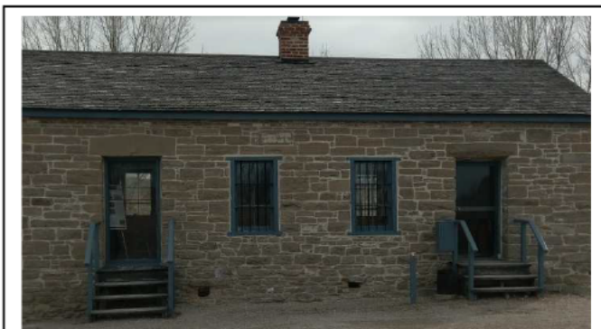
Front of Old Guardhouse January 2018

One of the highlights of each day at a frontier military post was the ceremonial changing of the guard. The ceremony was performed in the morning and the soldiers on guardhouse duty were attired in their dress uniforms and white gloves. The ceremony consisted of the soldiers being marched to the parade grounds by the company first sergeant and then were inspected by the Sergeant Major and the Officer of the Day. When the