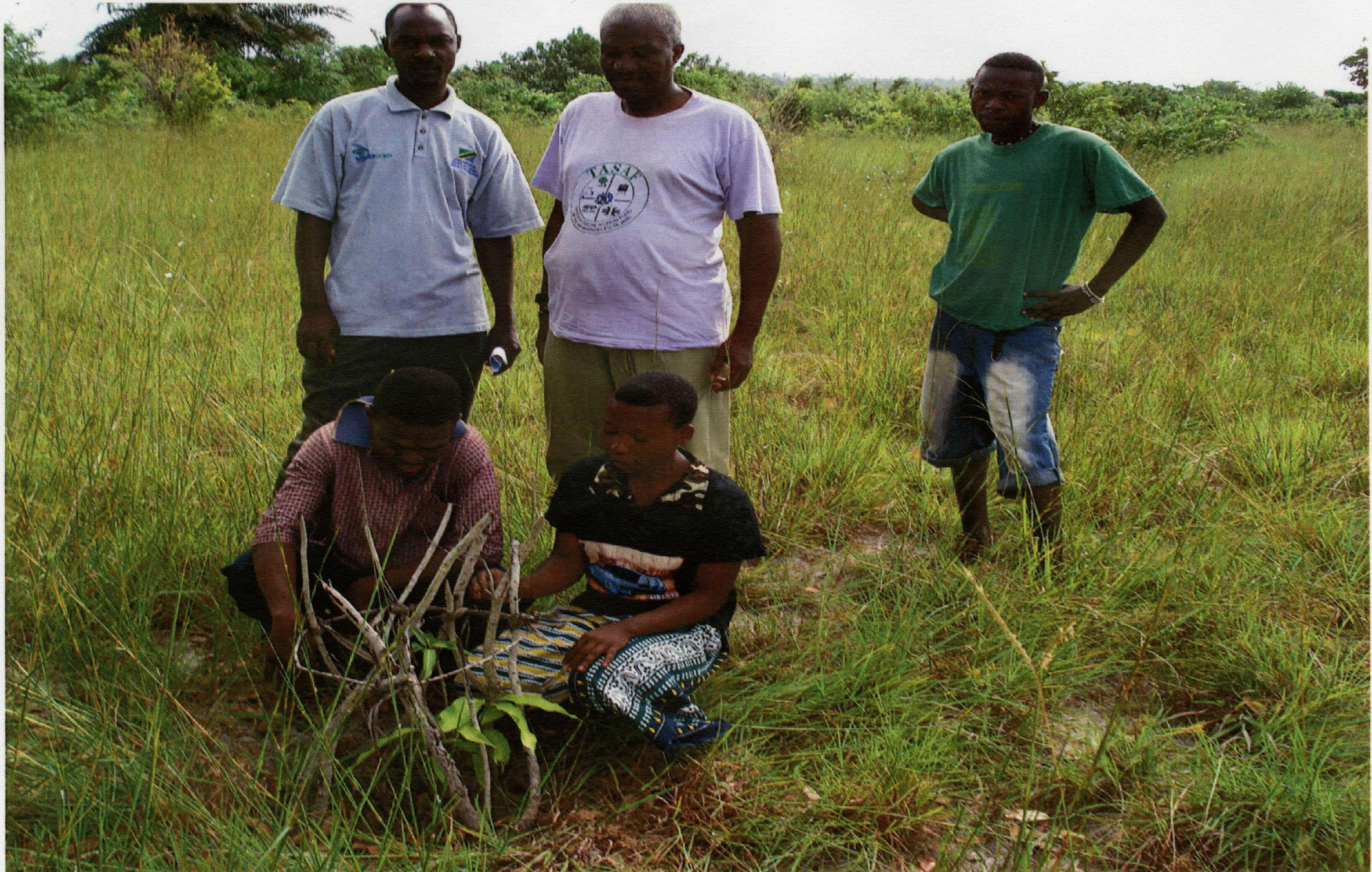
Photo 3: Researcher and Leaders of Nyota Njema group looking one of the planted Red Indian mango tree in Homboza village