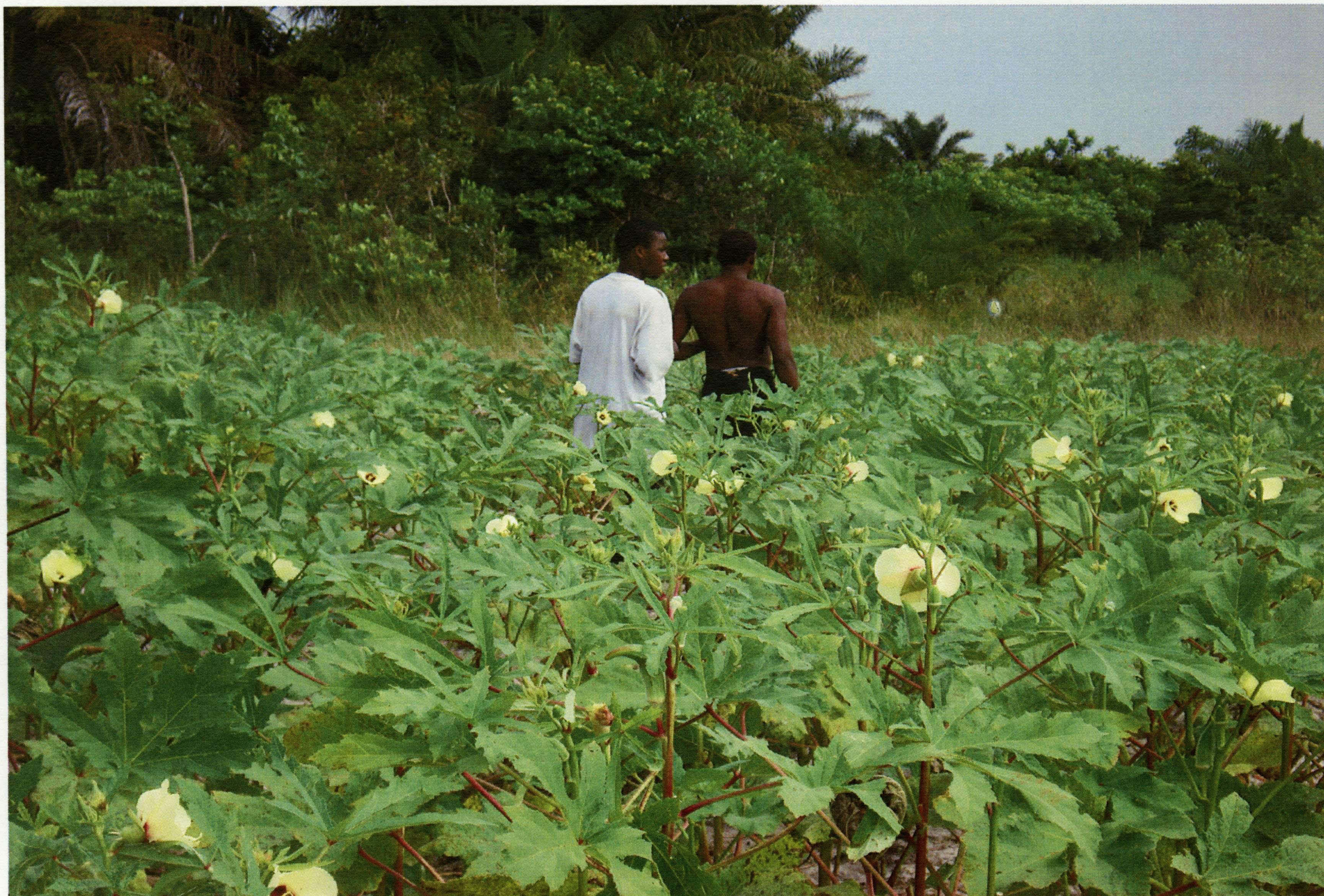
Photo No 1: Nyota Njema members in one of their established farm planted with okra in Homboza village