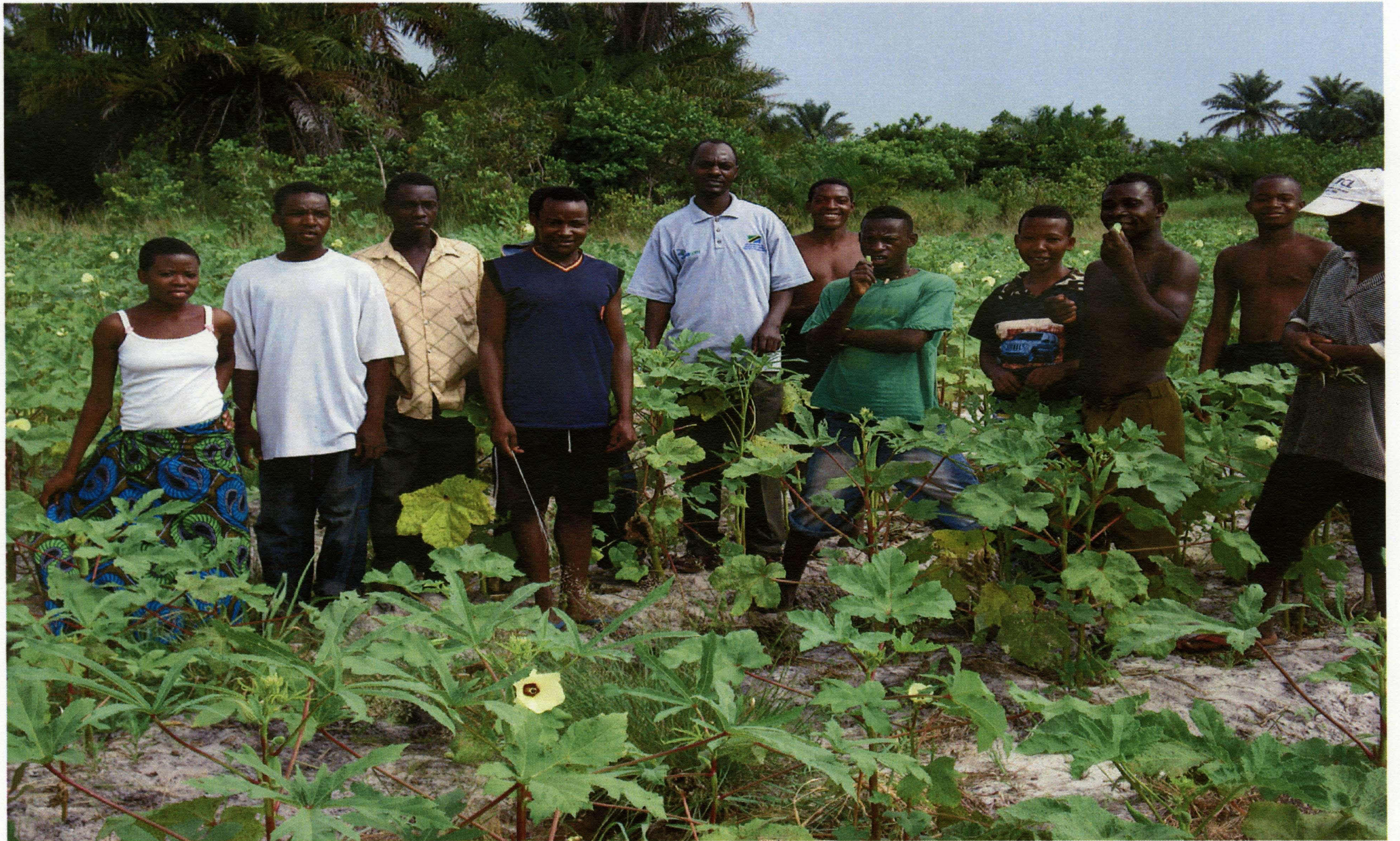
Photo No 2: Researcher in photo picture with members of Nyota Njema group in one of their farm established in Homboza Village.