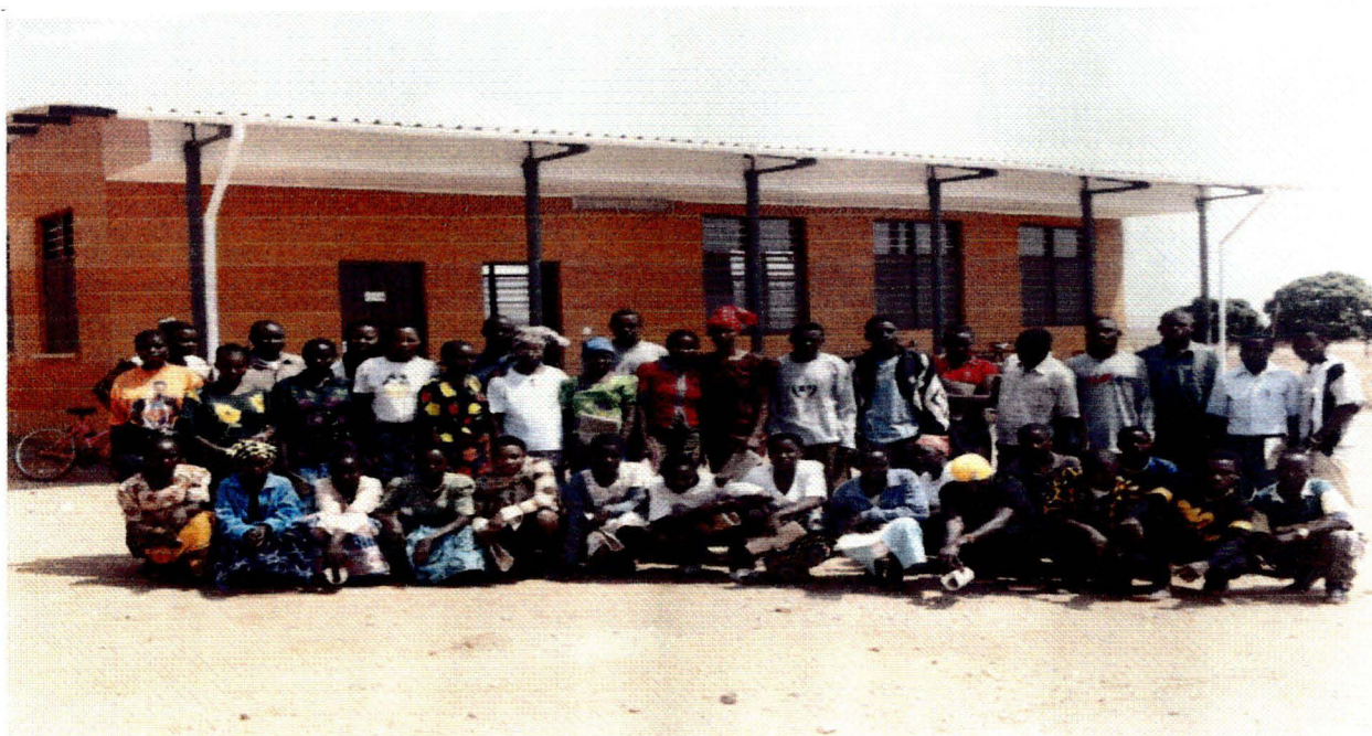
Peer educators (youth) training