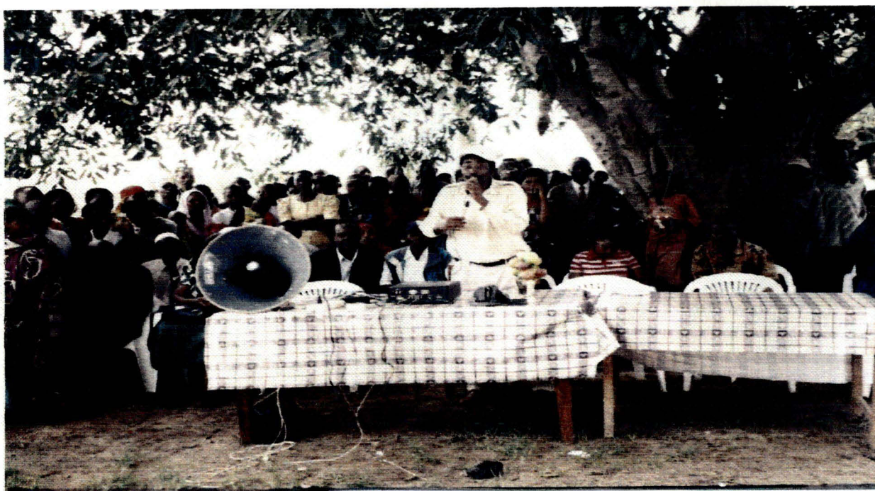
One of the awareness meetings