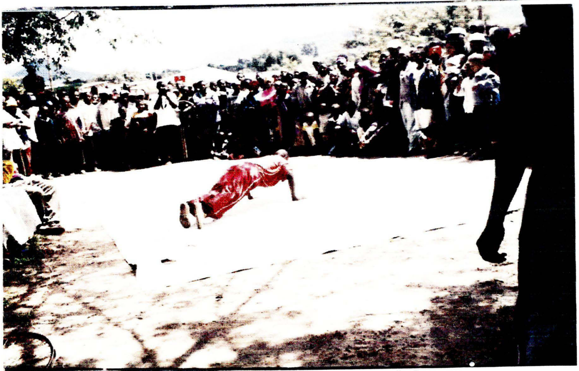
Acrobatic group was used in mobilizing community members during awareness meetings.