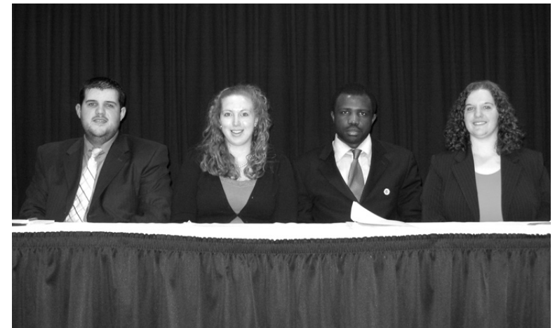
Right: SGA Executive Board 2007

The SGA is eager for a new year and hope that it will bring new and exciting things for the student body. In addition to the executive board and House of Reps. the Senate is a great part of the SGA to be involved in and the SGA is always looking for senators so even though the elections are over feel free to fill out an application any time! •