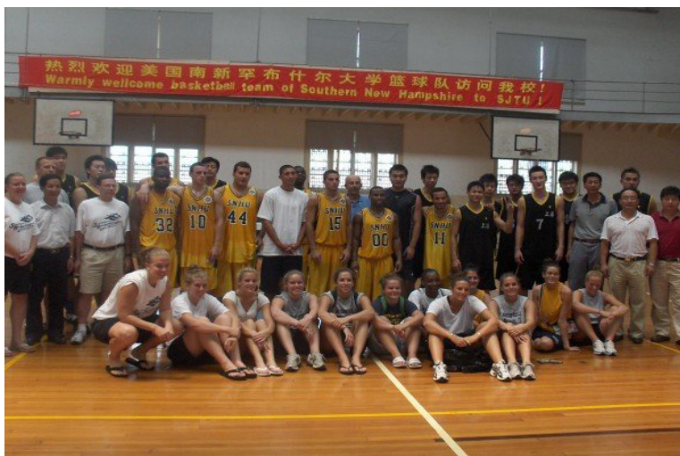
Shanghai group - China 2007