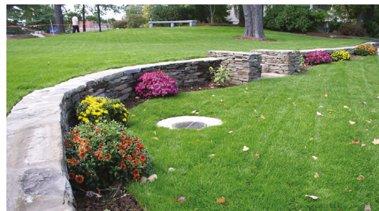
LTI provides new landscape at SNHU.