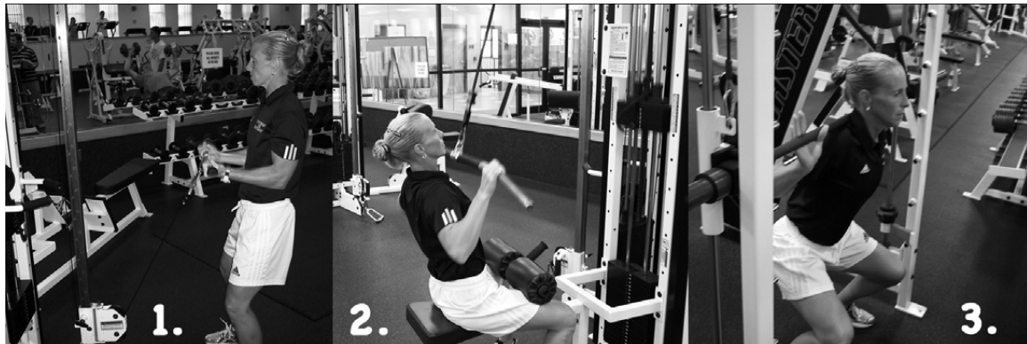
Cable Bicep Curl