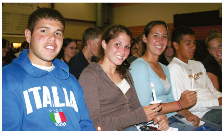
Freshmen in attendance at 2007 Convocation.

The ceremony was followed by a reception in the small gym where refreshments were served. •