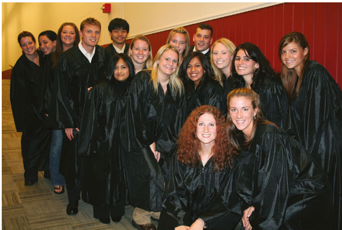
Seniors gather in SNHU Athletic Complex for 2007 Convocation.