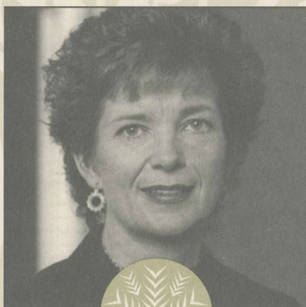
MARY ROBINSON PRESIDENT OF IRELAND 1994 CATHERINE A. DUNFEY AWARD