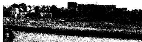
Antecuary of Kari Field, EBCCG