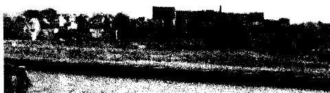
Antecuary of Kari Field, EBCCG