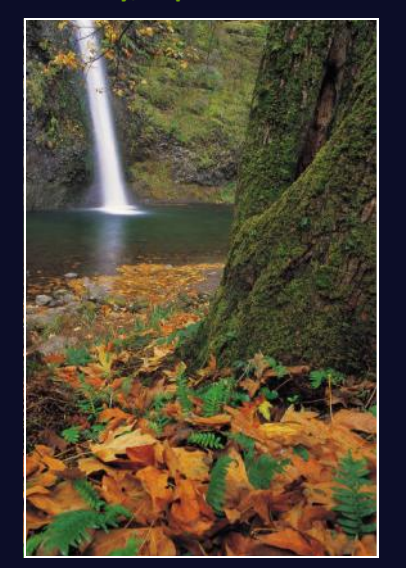
First Day of Autumn Thursday, September 23rd