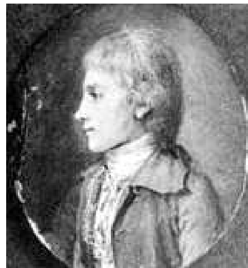
Figure 1: Young Alexander Hamilton - Age 15