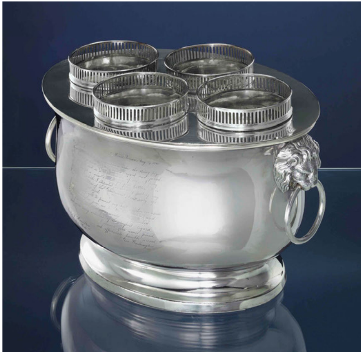
Figure 7: George Washington’s Wine Cooler Presented to Alexander Hamilton

remain your sincere friend, and Affectionate Humble Servant.” 23 This wine cooler was treasured by Eliza for the rest of her life and had been subsequently passed down in the family.