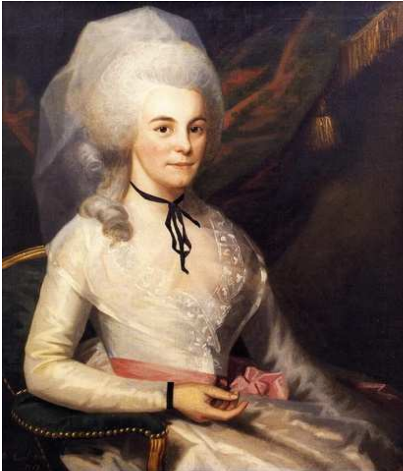
Figure 9: Mrs. Alexander Hamilton by Ralph Earle, 1787

“herself merry at the distress of the other Ladies.” 15 She was a vivacious, intelligent, and amiable woman who impressed many in Albany society.