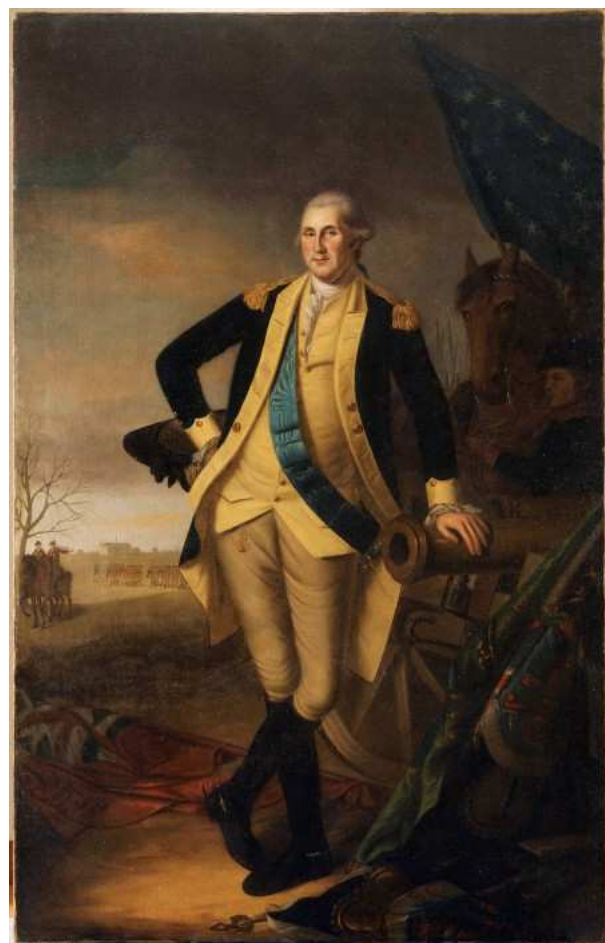
Figure 5: George Washington at the Battle of Princeton, 1779, Charles Willson Peale.

George Washington invokes the image of a detached, unreachable man who peers out from the canvas of Charles Willson Peale, Rembrandt Peale, Gilbert Stuart, and John Trumbull. Yet, George Washington was a complex man with a burden placed upon him that few today could possibly comprehend. The relationships he formed with those he trusted implicitly, or brought into his “family,” are intriguing. Was Washington searching to fill a void from his own childhood? Or was he inclined to bring young, bright men into his fold to allow himself the opportunity to parent them as a result of his inability to father children of his own? These two questions bring forth the relationship between Hamilton and Washington.