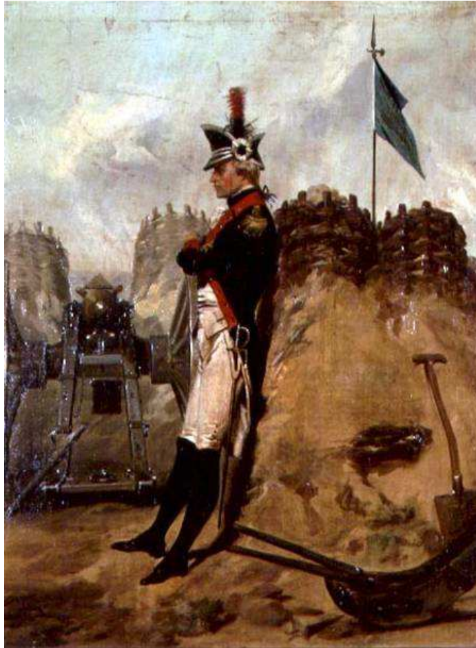
Figure 6: Alexander Hamilton in the Uniform of the New York Artillery, Alonzo Chappel

Within two weeks, Hamilton received a note from Washington personally inviting him to join Washington's staff as an aide-de-camp. This was not the first time Hamilton had been approached for a staff position under a commanding general. Three other generals—Alexander McDougall, Nathanael Greene, and Lord Stirling—expressed their interest in obtaining Hamilton for their staffs. Hamilton did not immediately accept the opportunity to join Washington's staff. His son relayed "having served with distinction through the most arduous campaign of the revolution, and having thus entitled him to rapid promotion in the line of the army, Hamilton hesitated much before he consented to relinquish this prospect for a place in the staff." Why did