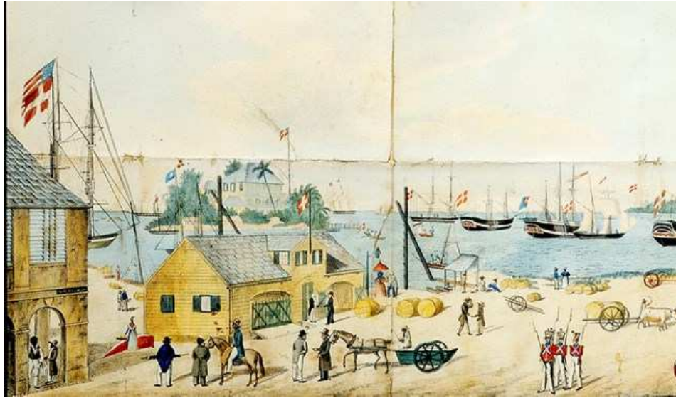
Figure 3: Port and Shipyard of Christiansted c. 1800.

benefit” to Hamilton and “he felt himself amply rewarded for his labours, by the method and facility which it imparted to him; and amid his various engagements in after years, adverted to it as the most useful part of his education.” 42