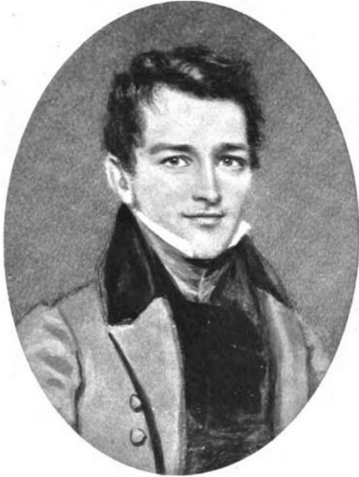
Figure 11: Philip Hamilton 1782-1801, age 20.