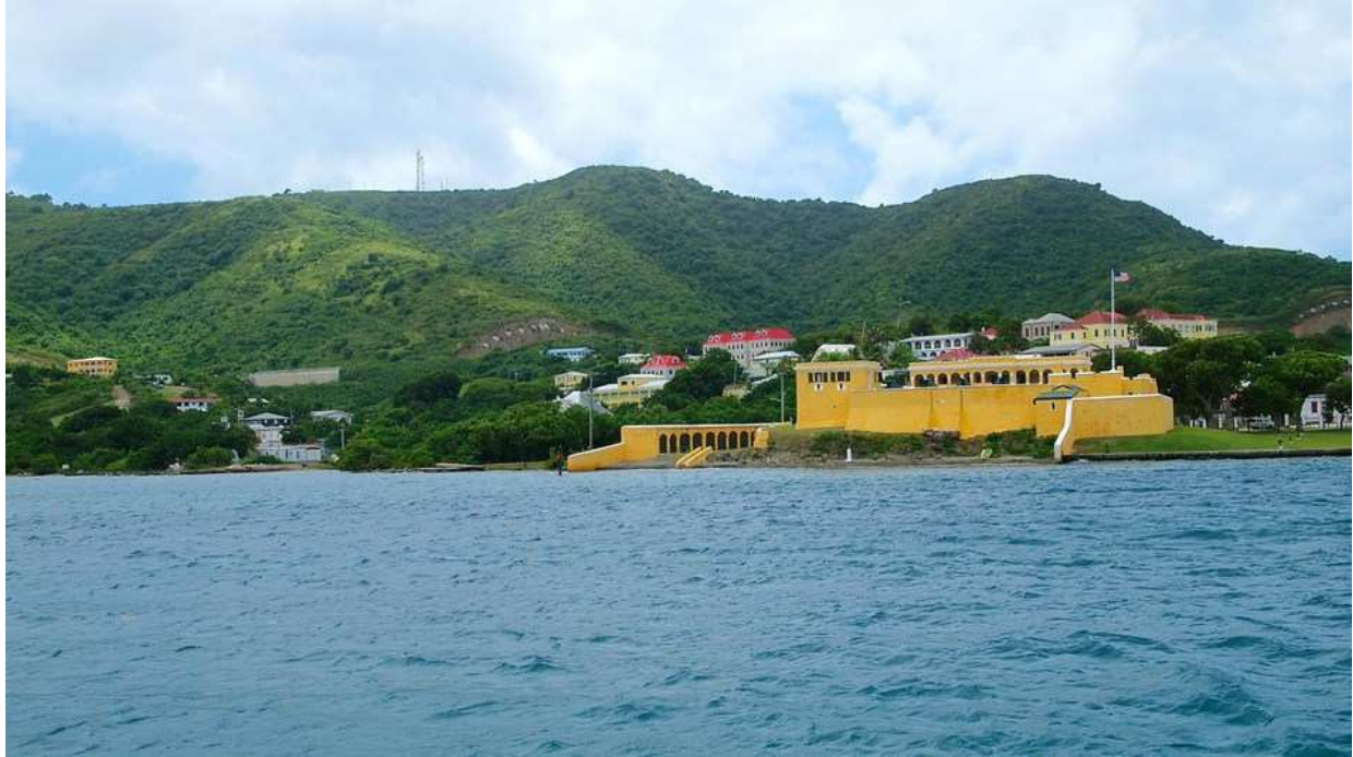
Figure 2: Fort Christiansvaern, National Park Service.

in adulthood frequently referenced his mother's adultery and supposed prostitution in an attempt to discredit him. John Adams famously referred to Hamilton as the "bastard brat of a Scotch peddler" two years after Hamilton's death. 14 After Rachel was released from prison, she fled to St. Kitts. In doing so, Rachel forfeited any future benefits that would have come from legal separation and doomed her next two children to a life labeled under illegitimacy.