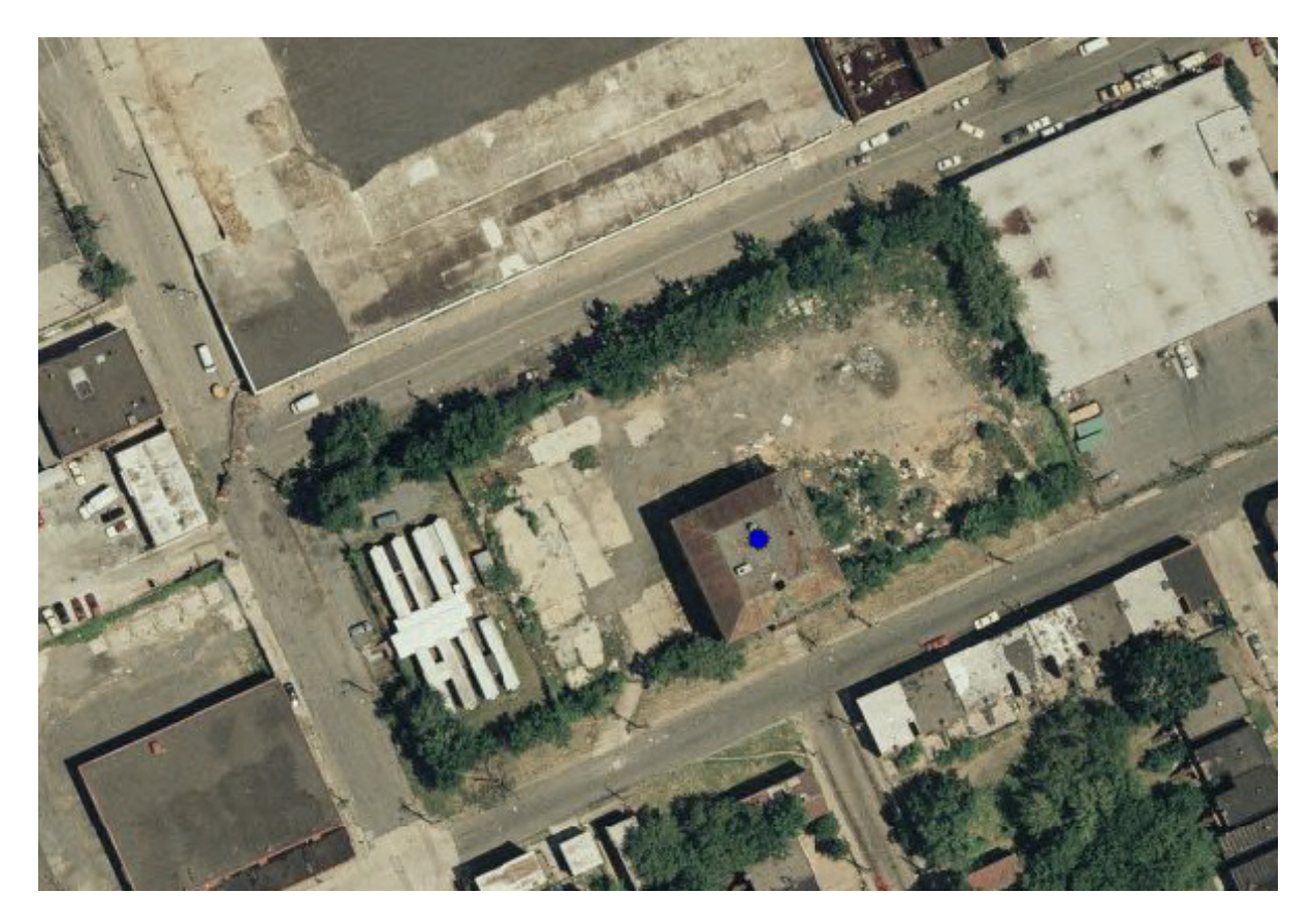
Aerial photo shows the roof of the Crummell School on its 2 ½ acre site and surrounding blighted properties