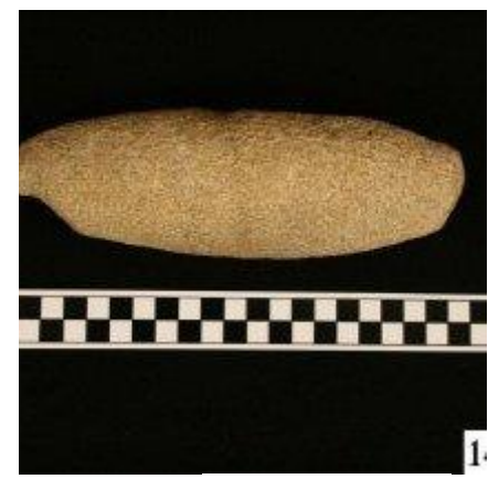
Figure 4: 141/16532 – Celt