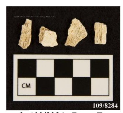
Figure 3: 109/8284 - Bone, Fragment