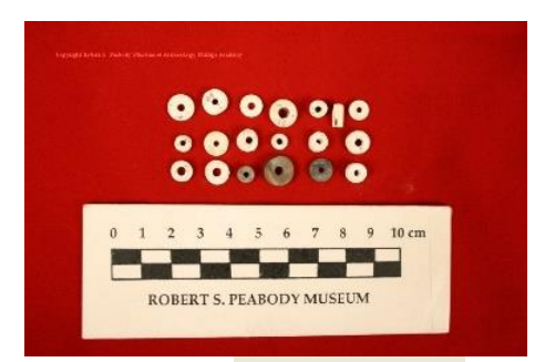
Figure 2: 97.6.615 - Bead