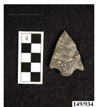
Figure 1: 149/934 - Point, Projectile