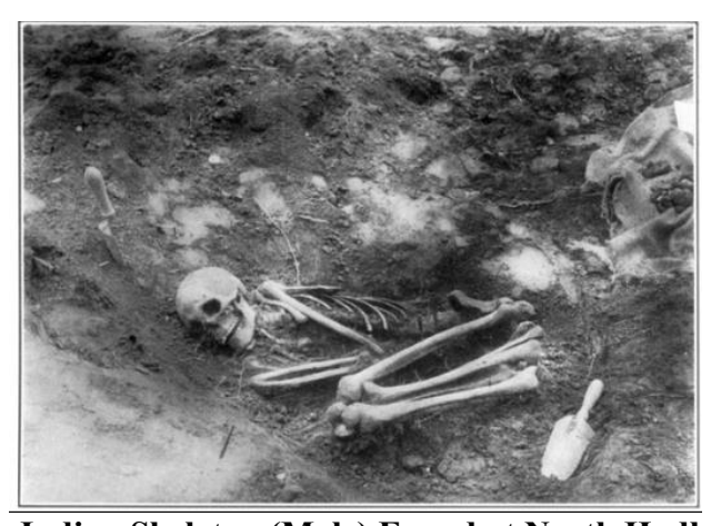
Figure 6: Indian Skeleton (Male) Found at North Hadley, Mass.