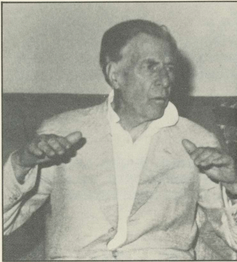
John Kenneth Galbraith