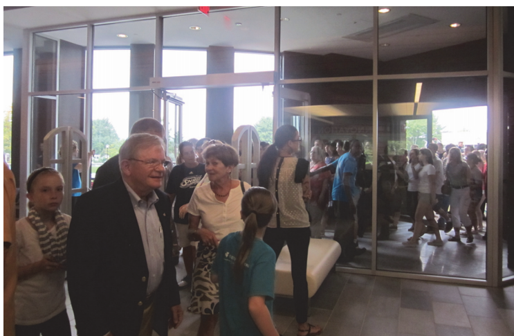
The first of many students, faculty, staff, and guests entering the first floor of the Library Learning Commons.