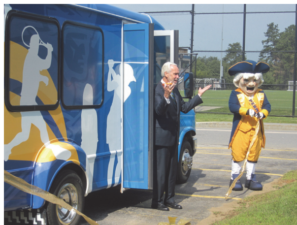
President LeBlanc cutting the ribbon to the new shuttle!

Tour guides still walk the inside circle of campus, such as Athletics and the Student Center, but now drive down to