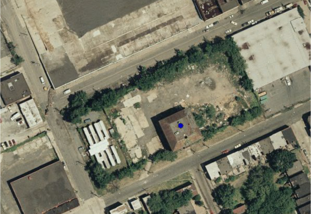
Aerial photo shows the roof of the Crummell School on its 2-½ acre site and surrounding blighted properties