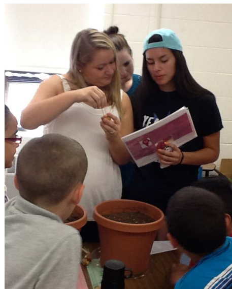
SNHU Student at Beech St. Elementary School.